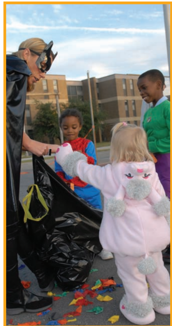
Surrounded by Spiderman, the Incredible Hulk and Fifi the poodle, Batwoman hands out balloons at the balloon stomp.