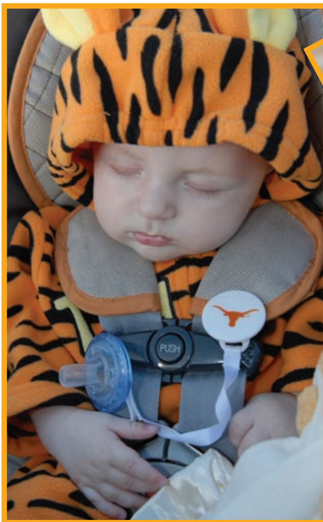
A baby Tigger takes a break from all of the excitement.