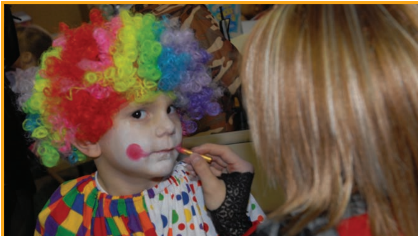
A little clown has his face painted at one of the stations set up at the festival.