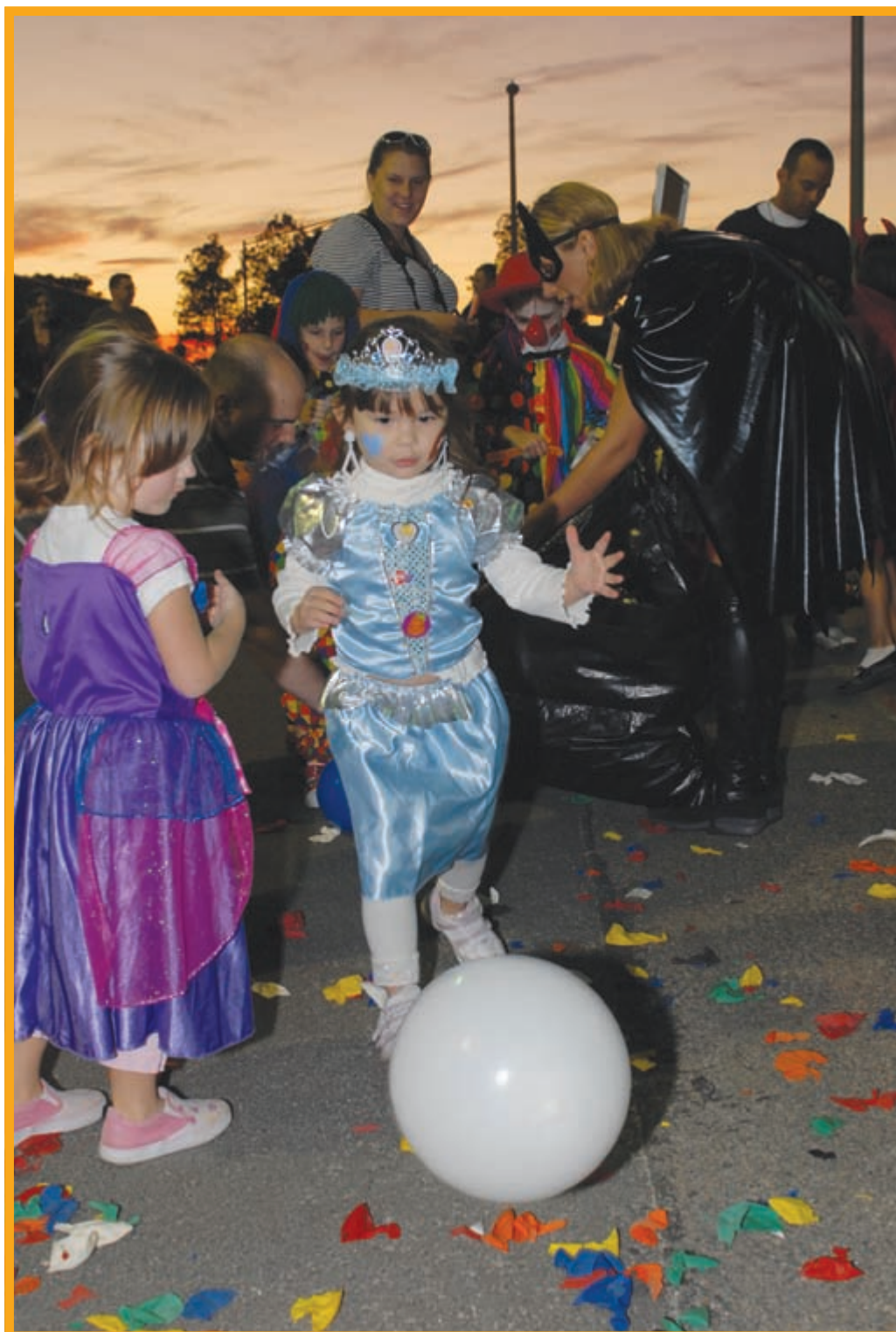
A princess chases after her balloon in an attempt to stomp it to receive the prize inside.