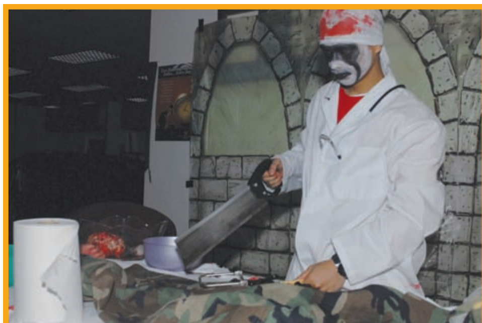
The butcher stays focused on his craft inside the haunted house.